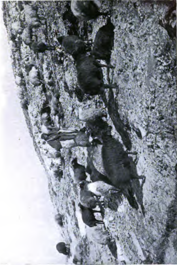
THE PASTORAL LIFE